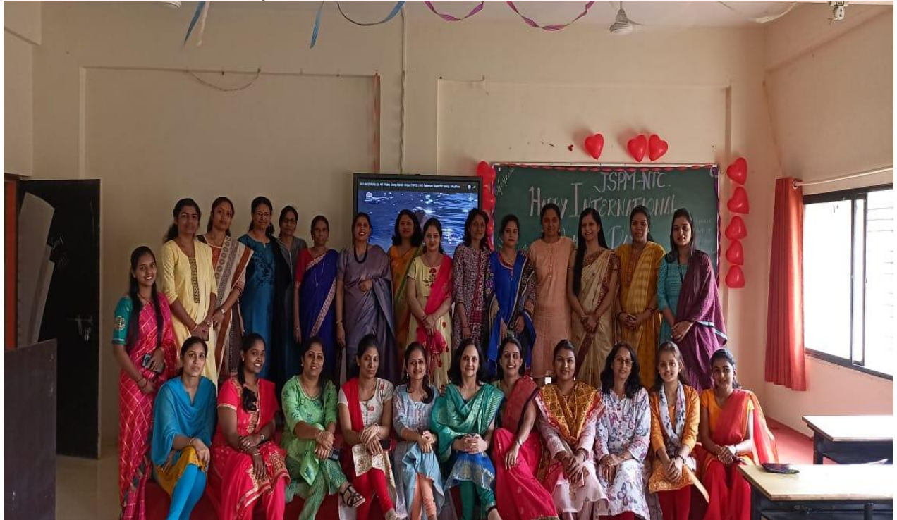
Women's Day Celebration in JSPM Narhe Technical Campus