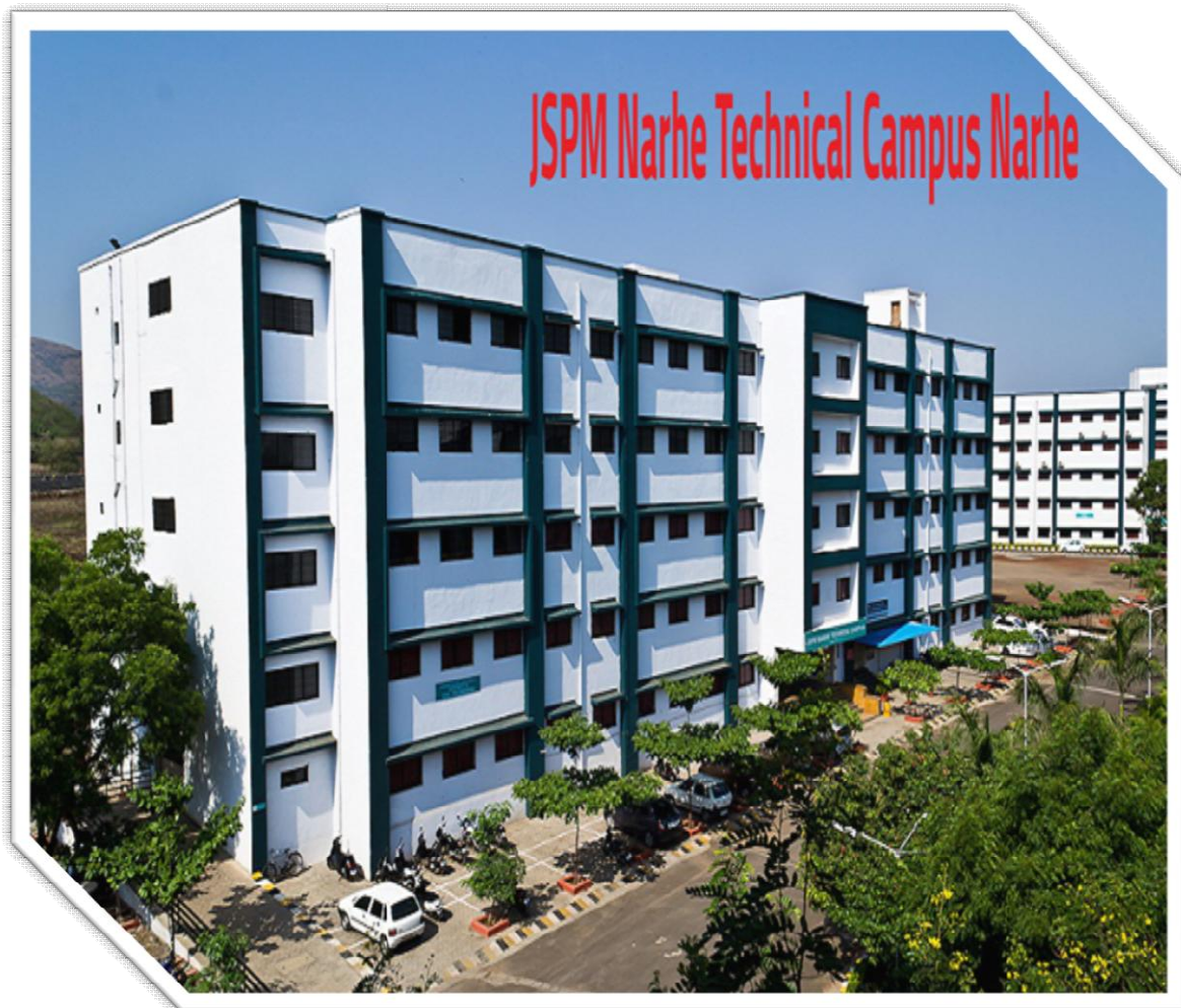
JSPM's Narhe Technical Campus, Narhe, Pune 41